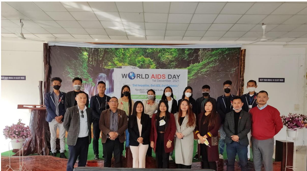
10 students from PGC RRC volunteered the World AIDS Day Program on 1 st Dec.,2021 at District Hospital, Phek organized by DAPCU, DLN, ELF & Vihaan.