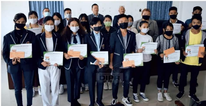
DC Phek, Razouvolie Dozo with officials and winners of the online competition activities on HIV, TB and Blood donation, in commemoration of 75 years of independence, at DC's Conference Hall on 22nd October 2021.