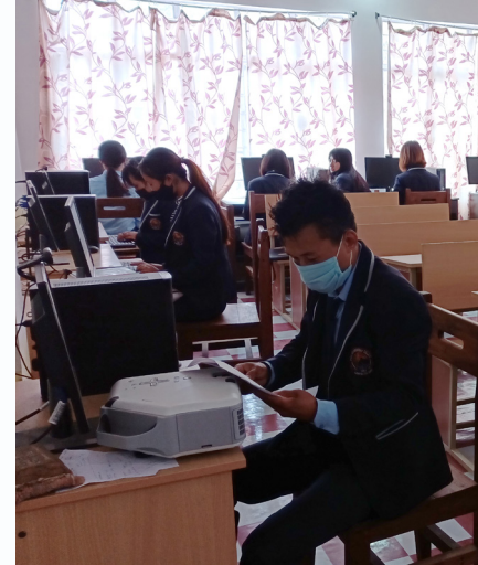
IT & C