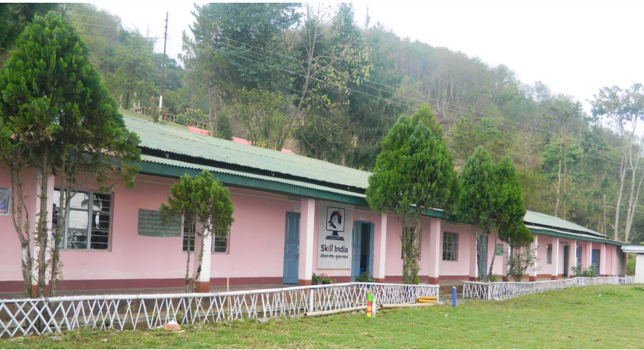
IGNOU Centre & Skill Development Centre