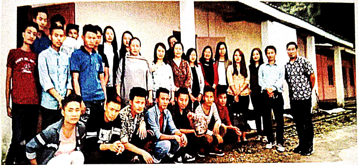
Workshop on mushroom cultivation on 14 th Sept., 2018