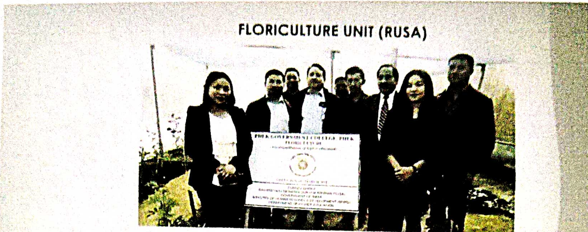
AAA team visiting the Floriculture Unit on 20 th Oct., 2018