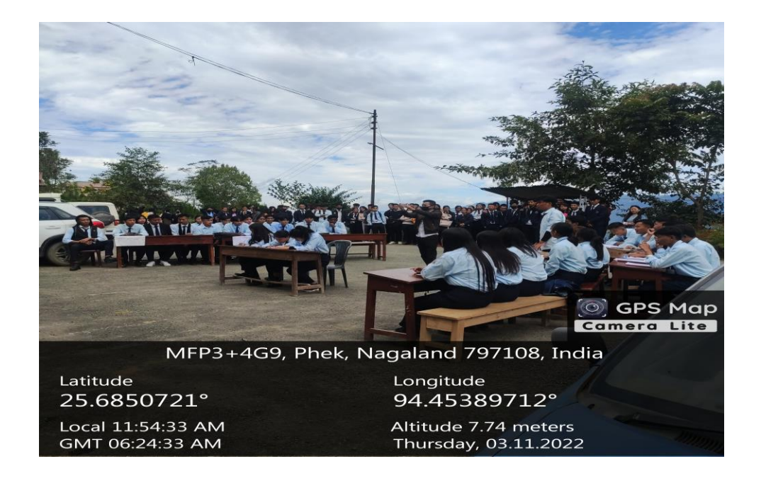
Mock Parliament by Political Science Department