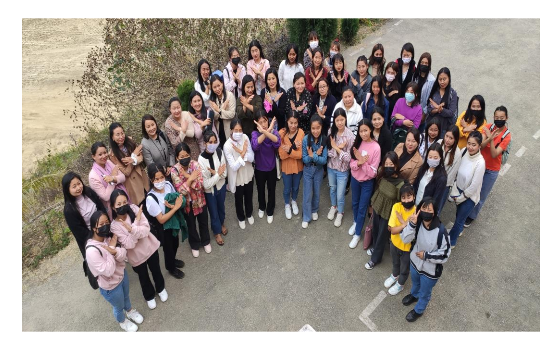
Celebrating International Women's Day 2022 #BreakTheBias