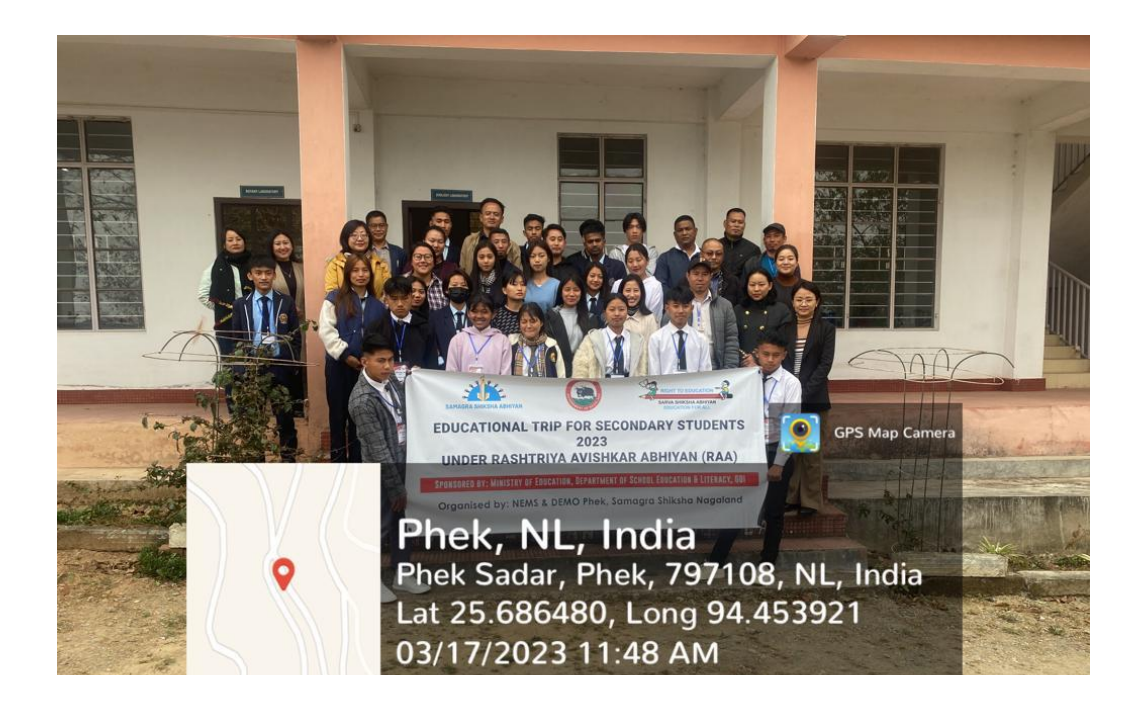
Practical Demonstration by Science Stream